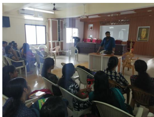
Motivational Session on ‘Healthy eating habits and the importance of exercise’