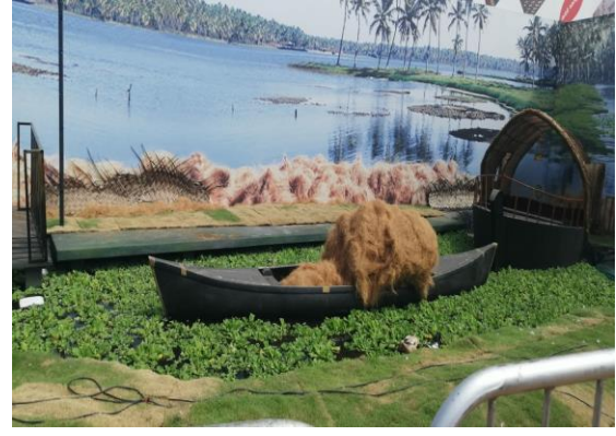
T.K.M.M.C. ASAPIANS at different pavilions of Coir Kerala Fest 2019