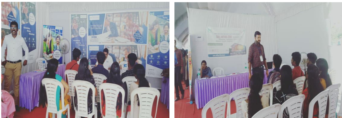
T.K.M.M.C. ASAPIANS at ASAP Transit Campus Alappuzha

ASAP has conducted a skill expo titled 'Skill Mithra' on 9 th of November 2019 at the Transit campus of ASAP Alappuzha. 9 students from our college have participated in the event and they were able to learn a lot about new generation courses that enhance ones' skills and enable them with sufficient job opportunities.