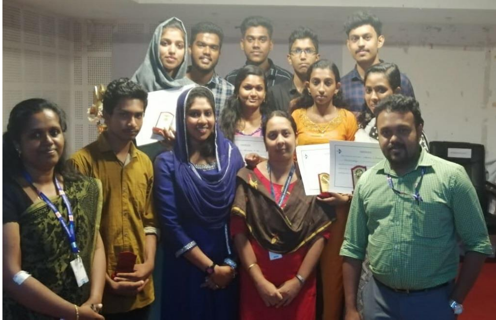
ASAPIANs with District Programme Manager and SDC Programme Manager