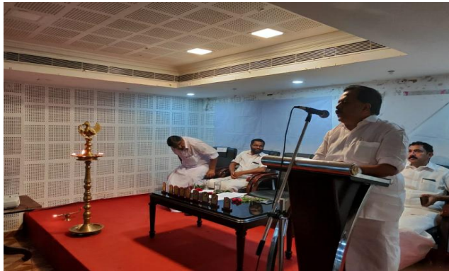
Inaugural Address by Sri.Ramesh Chennithala MLA, Hon. Opposition leader