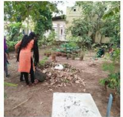
5. Observed ' Gandhi Jayanthy ' Day by Campus cleaning programme of NSS Volunteers on 2 nd Oct-2016