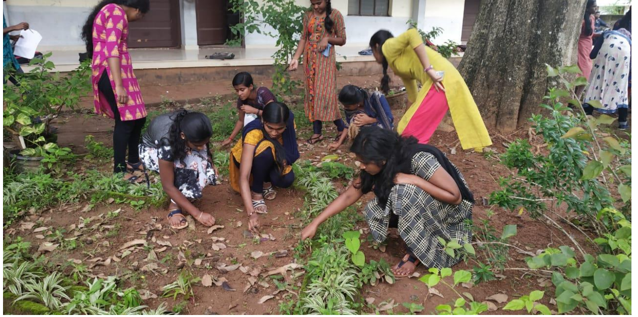
4. Formed a ' Plastic Brigade ' from among NSS Volunteers