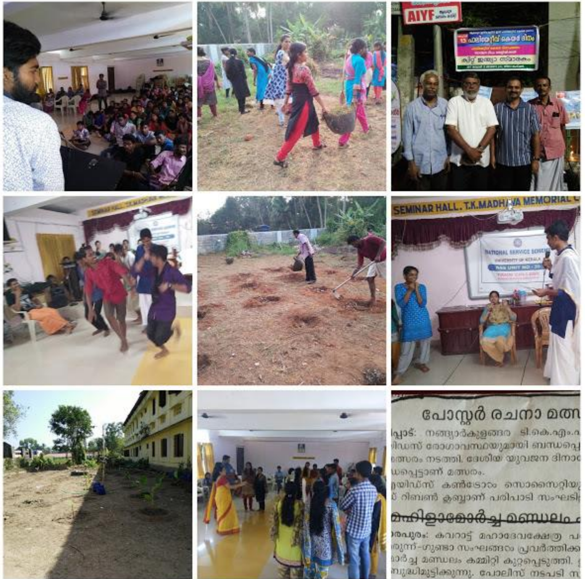
13. Organized poster competition on multiple aspects of AIDS by NSS volunteers on 12.1.2017